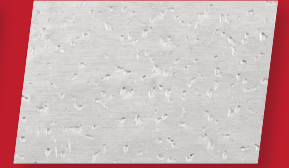
A = ALUMINUM