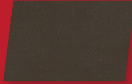
8 = DARK BRONZE