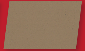
5 = DESERT BROWN