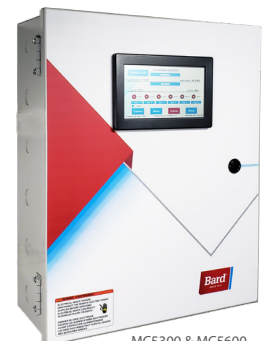
MC5300 & MC5600