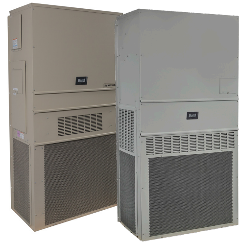
Wall-Mount™ Heat Pump