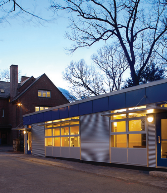
The Relocatable Green Modular Classroom in front of the main building at the Carroll School in Lincoln, Massachusetts.